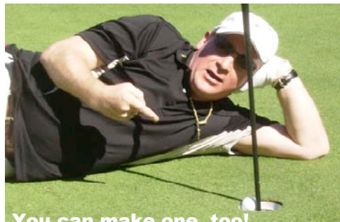
You can make one, too!