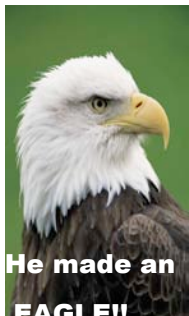
He made an EAGLE!